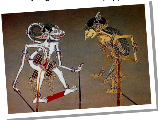
Wayang kulit shadow puppets

Sumatra is an island with a troubled past of a civil war, the 2004 Boxing Day tsunami and several earthquakes. Nevertheless, Sumatra is a unique place with