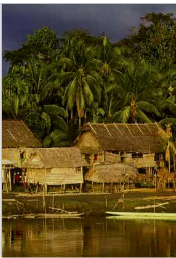
Stilt house in Papua

Bali is so well known, it is sometimes thought of as a small country rather than a part of Indonesia! Bali has a population of almost 4 million people, the majority being Hindus. Bali is most famous for its shopping, beaches, beautiful scenery and most of all, friendly locals. Very popular with tourists, Bali is a world-renowned surfing destination.