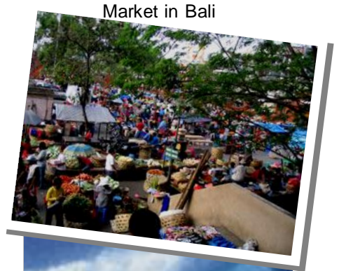
Market in Bali

Javanese traditions, such as the shadow puppets called wayang kulit and yummy satay! And no visit is complete without a visit to Candi Borobudur and Candi Prambanan.