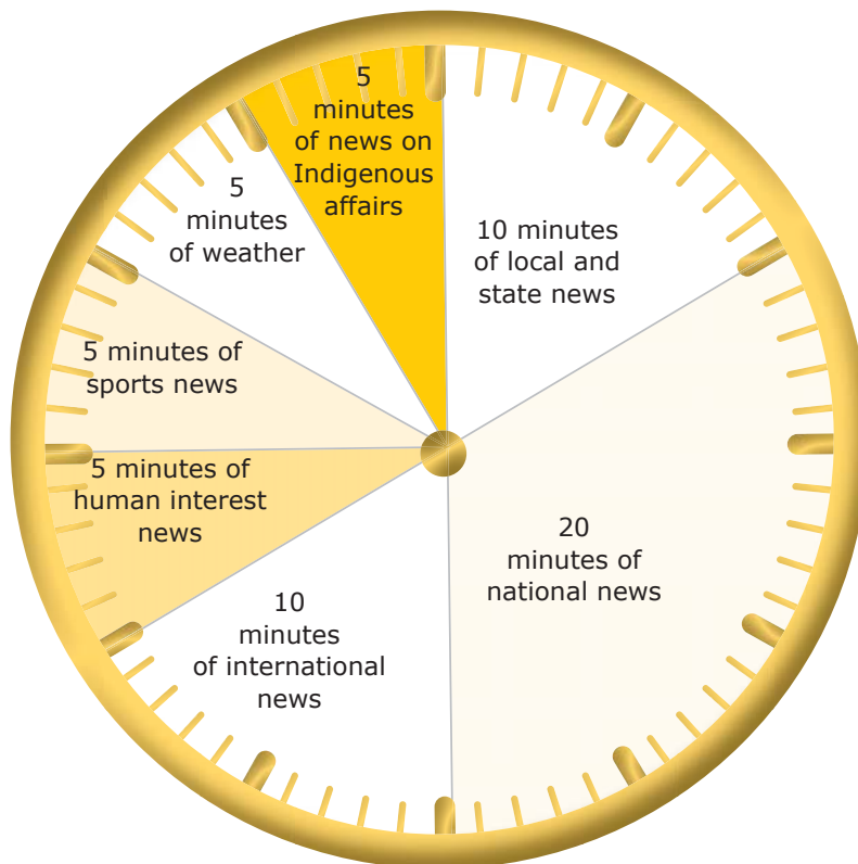
Title: News at six