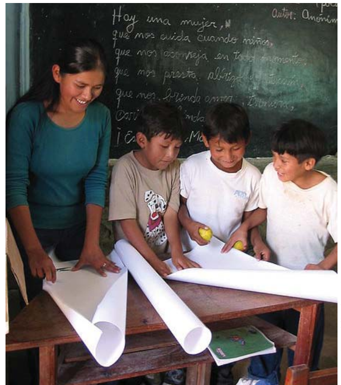
A USAID volunteer at a school in Bolivia.